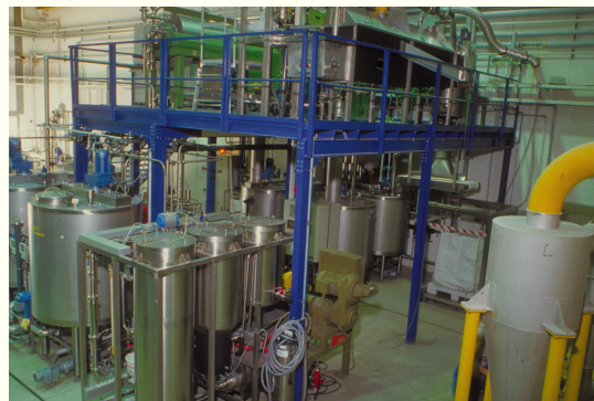
Fig.1: General view of the Fraunhofer pilot plant

The success of increasing the use of plant proteins into non-food applications is mainly determined through the availability of processes for functionalizing proteins by chemical or physico-chemical modification.